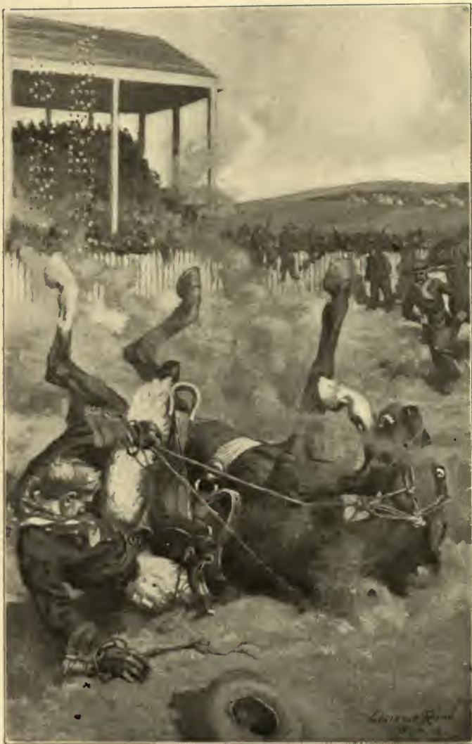
THE HORSE FLUNG ITSELF BACKWARD IN A SOMERSAULT, RISKING ITS OWN NECK IN ORDER TO BREAK ITS MASTER'S.